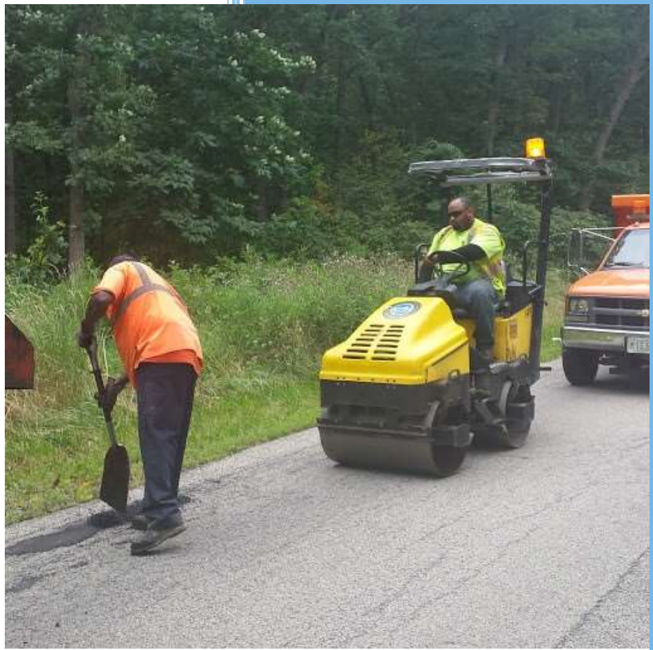
PUBLIC WORKS STREET CREW MAKING ROAD REPAIRS.