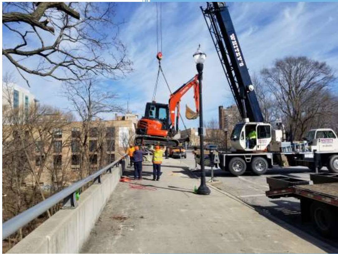
GENESEE BRIDGE REPAIRS MARCH 2018.