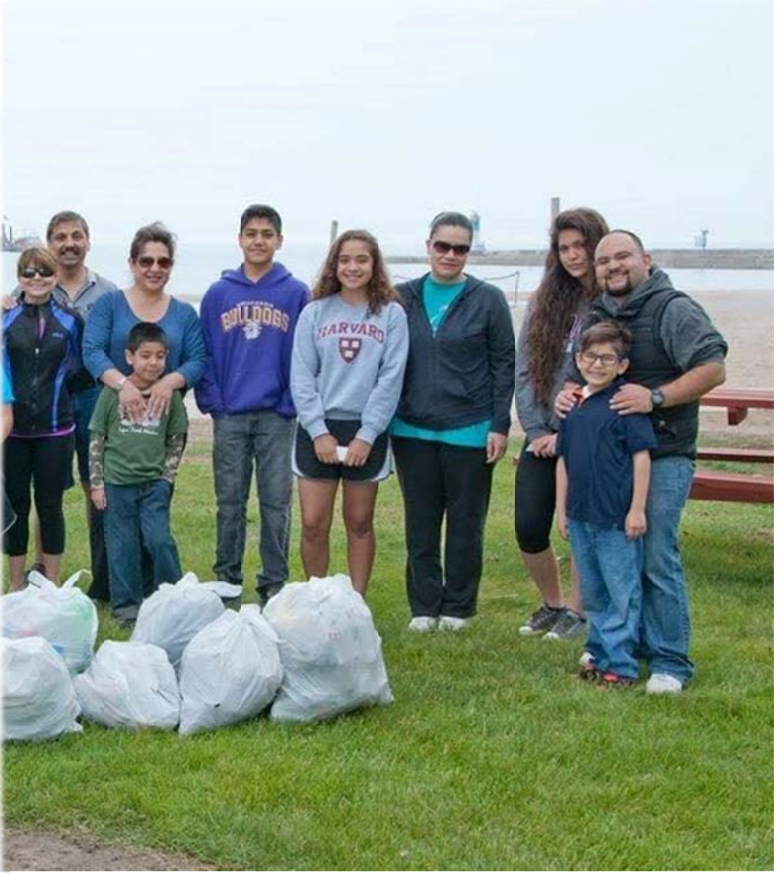
City Collector Staff, Friends & Family Volunteer at a Waukegan Lakefront Clean-Up Event.