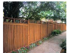
Clapboard “Savanna” Fence

No fence whether permitted or required shall be obtained without first obtaining a fence permit from the Building Department. Application shall be made on forms provided by the Building Department.