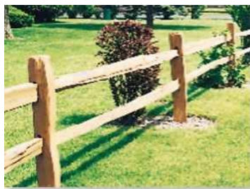
Split Rail Fence

Getting the right fence for the job means faster results, less cost and greater enjoyment. Think ahead to when considering a fence. Will it be too tall or short for the area, overpowering its surroundings and building?