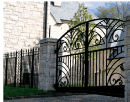
Wrought Iron Fence

Fencing is much more than window-dressing, it is an important consideration in the design review process. Fences add accent and value to a property, and can be used for screening.