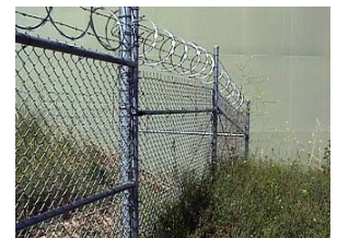
Barbed Wire Fence

The use of barbed wire or electrically-charged fences is prohibited on all residential lots. Such fences may be approved by the Development Review Board for lots other than residential, but not below a height of seven feet.