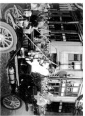
Eddie "Rochester" Anderson & Jack Benny riding in the "Maxwell" at the Corner of Genesee and Washington Streets.