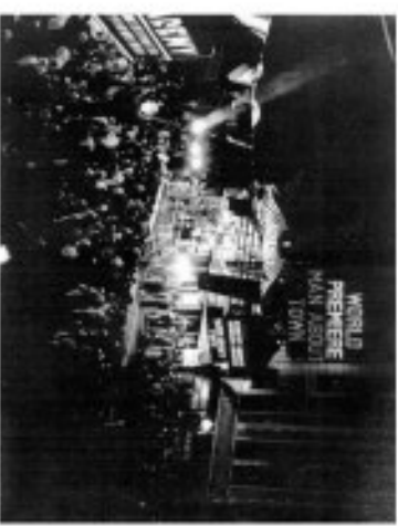
"Man About Town" premiere at the Genesee Theatre at 201 N. Genesee Street on June 25, 1939.