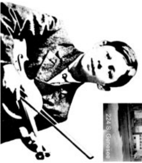
Young Benny Kubelsky with his violin.

Ben learned to play the violin at an early age. His parents thought that it was his only shot at a successful career.